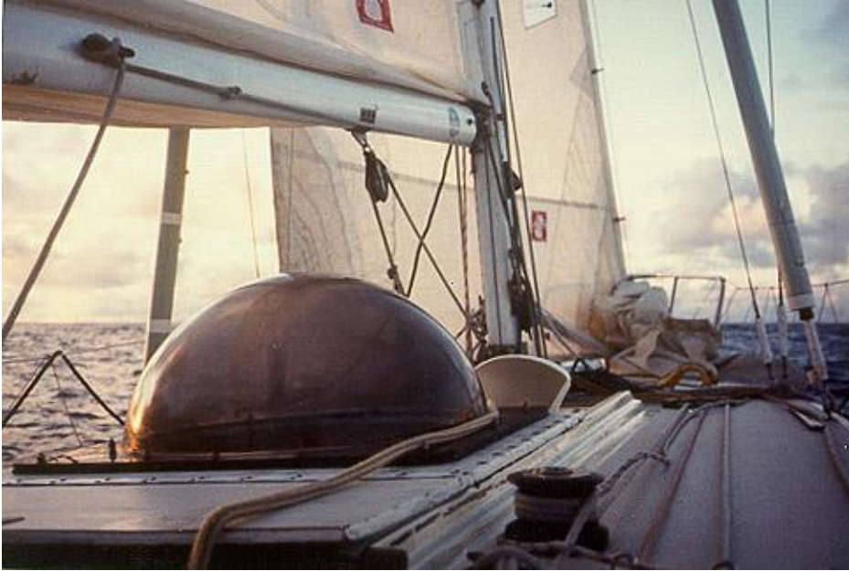
Typical Pacific High weather: Smooth water and a light headwind. Note the dome, the harness tether attached near the mast step, extra ventilator cowls, and anti-chafe gear on the aft lowers.