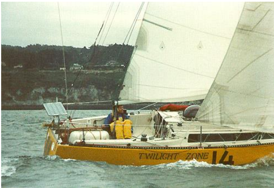
Twilight Zone, a Merit 25, at the start of the Singlehanded Transpac in 1986. The dome replaced the sliding hatch.

For years after your trip, when you work on your boat at the dock or in the boatyard, you will overhear passersby talking about the various boats they see as they walk by. One voice will say, "in 2014 that boat sailed all the way to Hawaii!" You get to shout back from your cabin, "and back!"